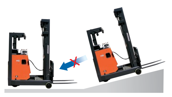
More soft driving by anti roll back & down, stop on the ramp function

Especially integrated grease fitting prolongs equipment life, and assist operator daily-checks.